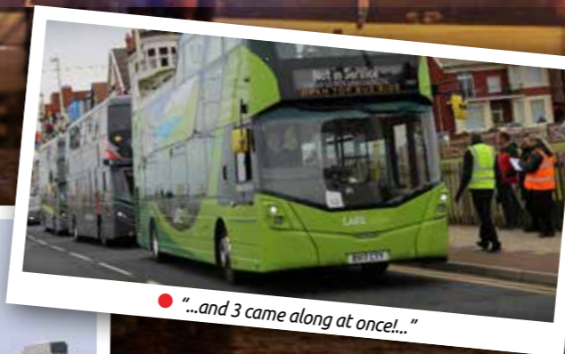
● “...and 3 came along at once!”