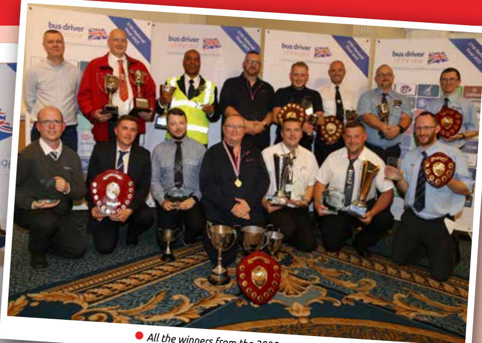
● All the winners from the 2025 competition.