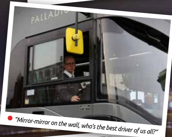
● “Mirror-mirror on the wall, who’s the best driver of us all?”