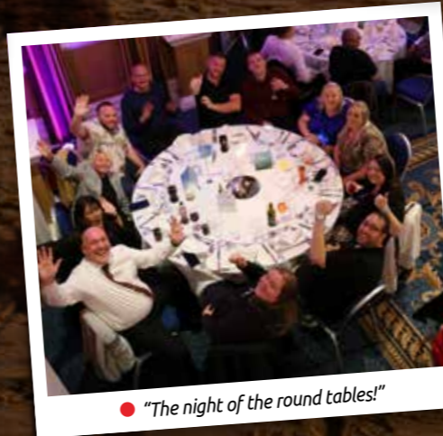
● “The night of the round tables!”