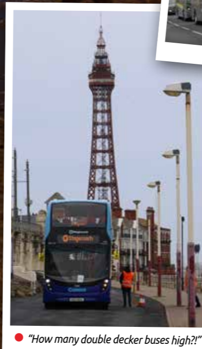
● “How many double decker buses high?”