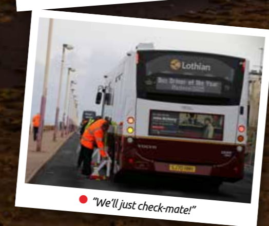
● “We’ll just check-mate!”