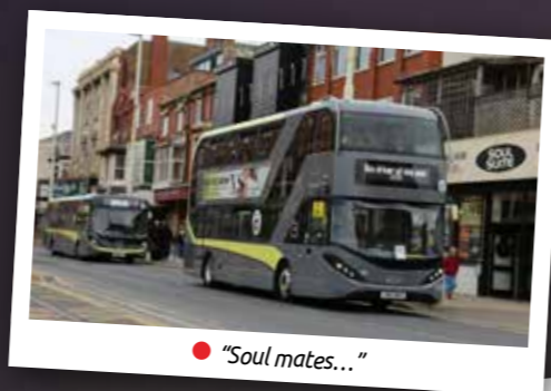
● “Soul mates...”