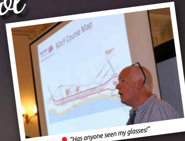
● “Has anyone seen my glasses!”