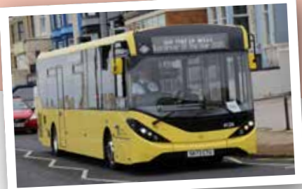
● The up to two year old category winner.