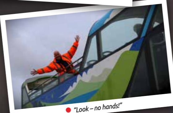
● “Look – no hands!”