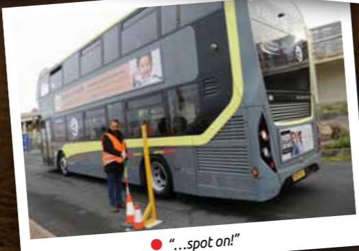
● “...spot on!”